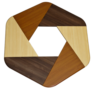
IGP-SET6-L-MF-LC Thermofoil with contoured edges