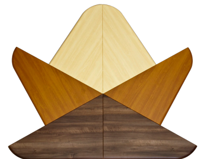
IGP-SET6-LR-ML-LC Laminate Tops & PVC Edges