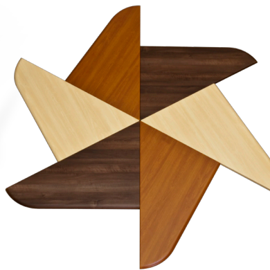
Pinwheel | Hexagon 6 Left Elements