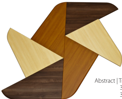
Abstract | Triangle | Maple Leaf 3 Left Elements 3 Right Elements