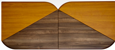
Linear Offset 2 Left Elements 2 Right Elements